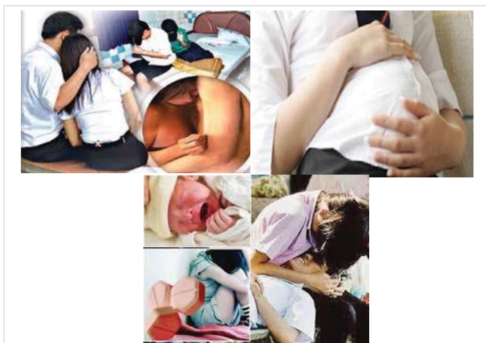
Figure 5: Affecting conditions of raising sexuality adolescence behaviours through teenage parents for their abusing and neglecting childhood health.

The ethnographic qualitative research data indicate that sexually active young people frequently engage in or are subjected to, risk-taking behaviors that may expose them to sexually transmitted infections and unwanted pregnancies. The children who are young age, and also engage in unprotected sexual intercourse with various types of sexualized with their partners and young girls especially had often experienced sexual coercion between the young guys in this village together (Figure 5). For example: