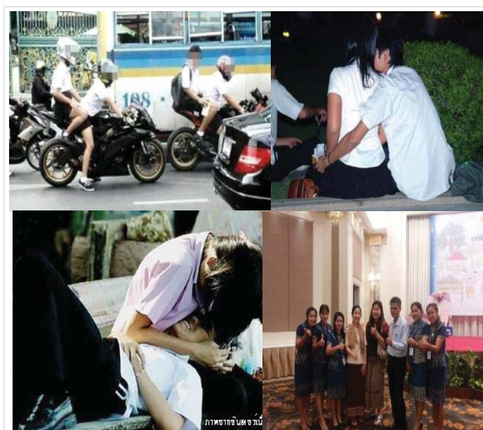
Figure 3: Research collections, limitations, and suggestions for this research project are provided.

The Act for Prevention and Solution of the Adolescent Pregnancy Problem 2016, which looks to reduce stigma on teen mothers, partially, young adolescents are generally less equipped than adults to make sound decisions and anticipate consequences of sexual behavior, although brain imaging and