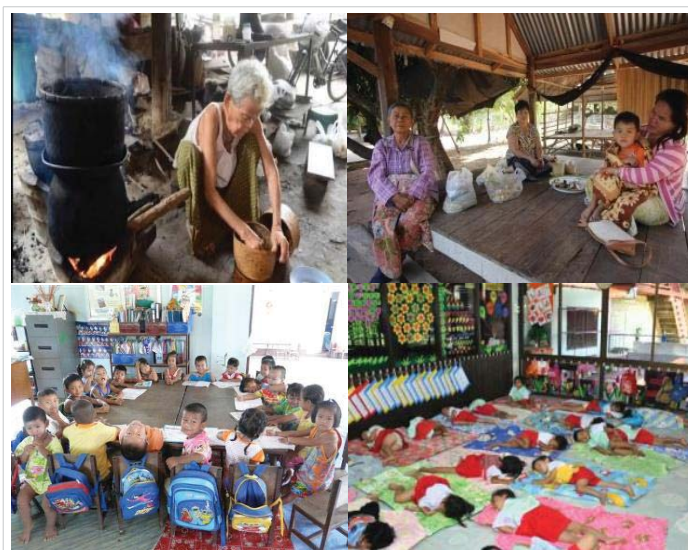
Figure 1: Cultural lifestyle in Khon Kean, Northeastern Region, and the Child Center Development for Children (CCDC).

Child abuse or child maltreatment is physical, sexual, or psychological maltreatment or neglect of a child or children,