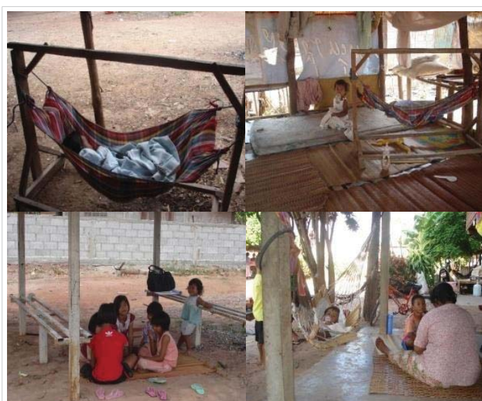
Figure 2: The environmental child development centers' sampling and affecting a child abuse by grandmothers.