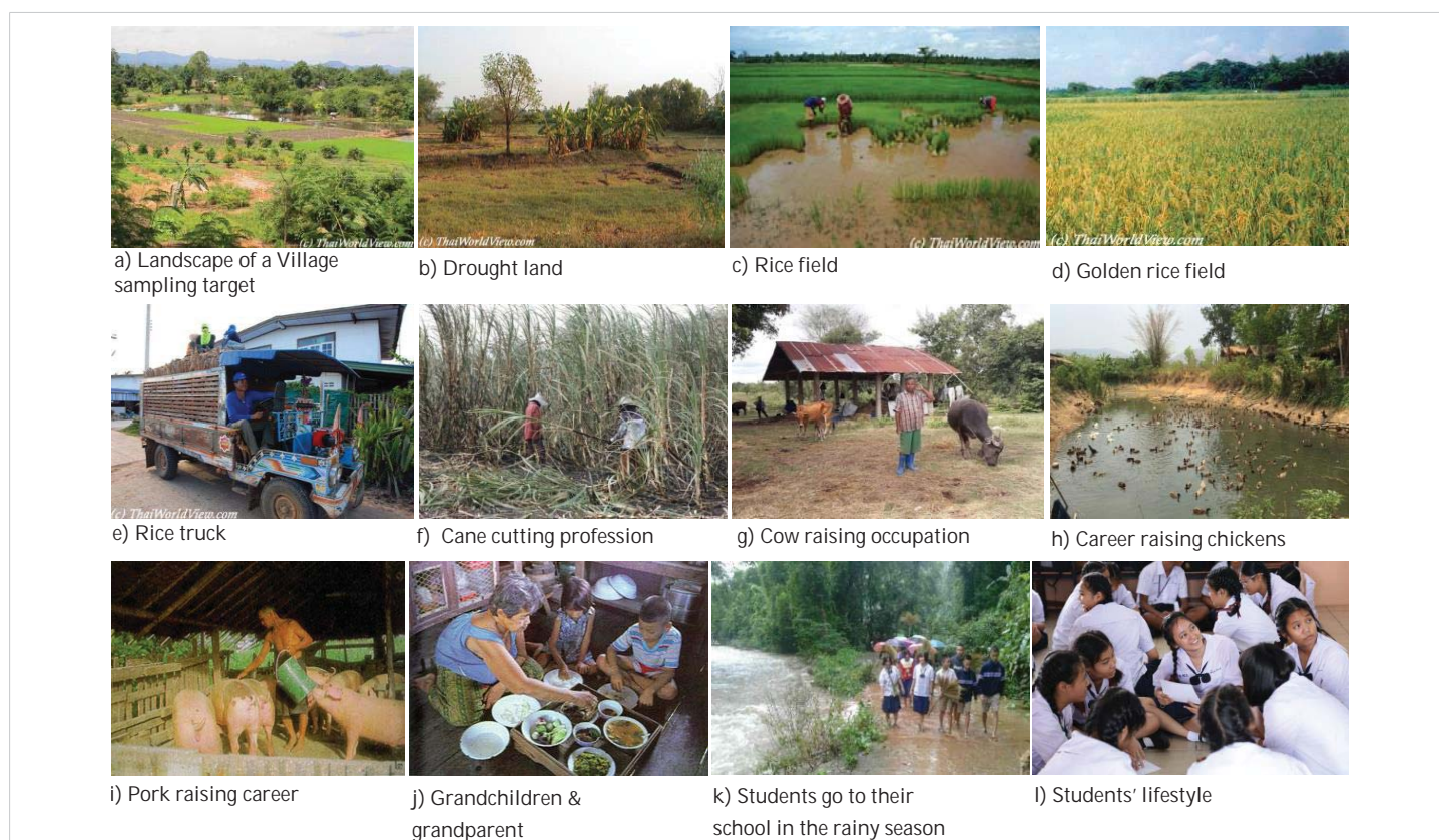
Figure 4: Occupation adequacies of people at a local community, Nampong District, Khon Kaen Province.

Because of the data, the collection is sensitive, telling their own life history as a father, mother, grandparent, grandmother, about child abuse to explain the connection connecting to children as the intergenerational transmission for a long time may use in-depth data collection techniques, the specific instruments to monitor and evaluate to the